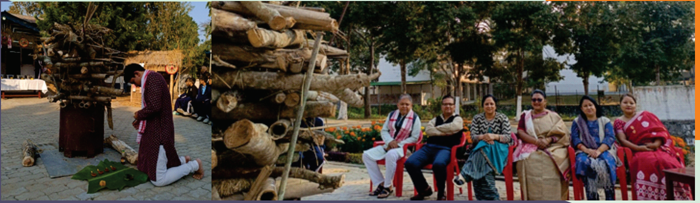
13 Jan, 2026: Hostellers honour Bihu tradition by offering prayers and lighting the ceremonial Meiji