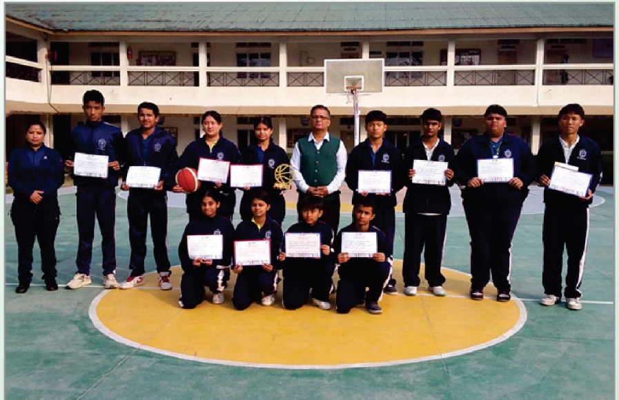
31 Jan, 2026: Distribution of the certificates to the students who participated in the Junior NBA Tournament.

Students of DPS Numaligarh participated in the Junior NBA Tournament held in Guwahati from 18-20 December, 2025. Both teams demonstrated exceptional skills and sportsmanship. The Girls' Team clinched the prestigious Third Position and though the Boys' Team did not make it to the podium, every student was awarded a participation certificate. Our students performed admirably and represented the school which is a notable achievement in itself and worthy of pride and recognition.