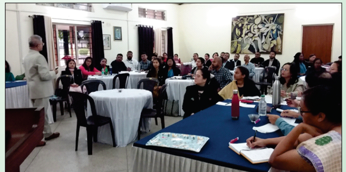
Teachers listening with rapt attention as Educators impart knowledge during Workshop