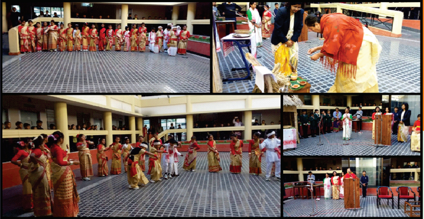
13 Jan, 2026: A special morning assembly was conducted to celebrate Magh Bihu.