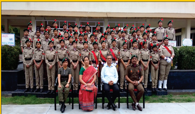
13 Mar, 2026: Special Morning Assembly conducted by the NCC cadets of Class VIII.