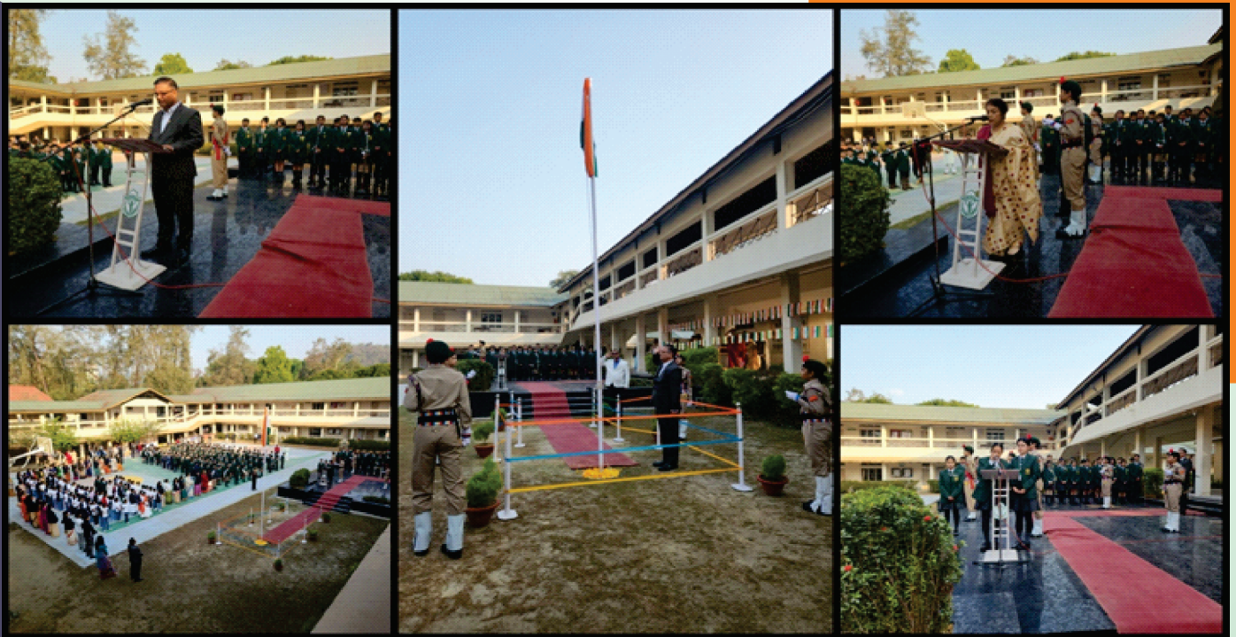
26 Jan, 2026: Republic Day Celebration.

Anthem. Rousing speeches and beautiful dances performed by the students displayed the pride and joy of the school on this momentous milestone in our nation's history. As the assembly came to a close, the shouts of 'Jai Hind' reverberated in every mind and heart and bade them to march into the year with the continued zeal to serve India.